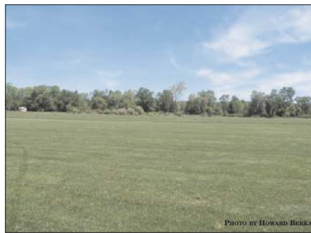
Island Raceway field at Great Meadows look down the middle