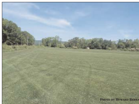
Island Raceway field at Great Meadows looking left