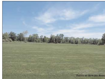
Island Raceway field at Great Meadows pan left to right